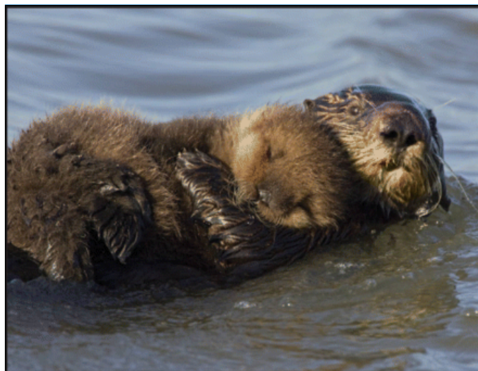
A sea otter mother holds her 2-week-old pup close in the waters of Elkhorn Slough, Moss Landing, California.

California Department of Fish and Game (CDFG) began recovering sea otter carcasses and examining them for cause of death over 36 years ago, but these were primarily gross examinations by biologists. This work established the fact that a high percentage of adult sea otters died yearly, and that adult prime